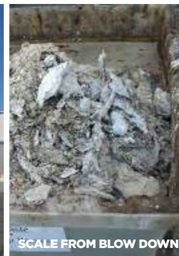
SCALE FROM BLOW DOWN